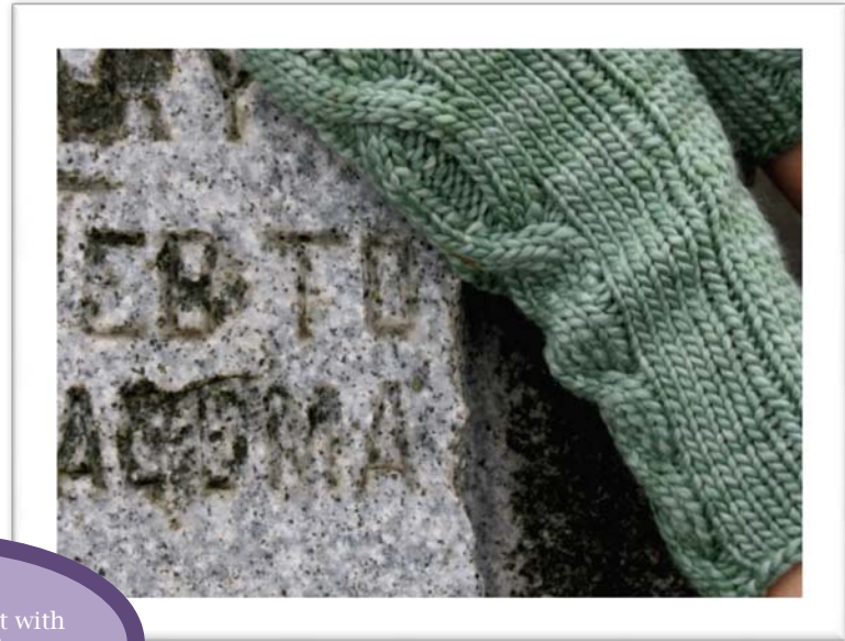
Photo sample knit with Butternut Woolens Silkie